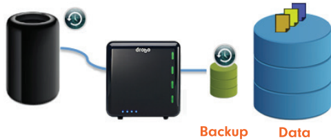
Time Machine and Drobo Direct Attached models

With the latest updates to the Drobo Direct Attached models you can now more easily control the maximum storage space available for Time Machine backups through Drobo Dashboard saving you time and simplifying setup. Within Drobo Dashboard you simply create a dedicated, fixed capacity volume for Time Machine's use, allowing you complete control over the amount of space allocated for backup.