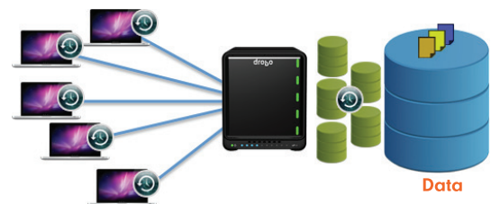
Time Machine and Drobo NAS Models

For many small businesses and workgroups the challenge of backing up their Mac clients to a central storage repository can be seemingly impossible. With the Drobo NAS products, setting up separate file shares for each Mac client is a few mouse clicks away creating separate and capacity controlled Time Machine backup volumes that will give consolidation and peace of mind knowing that data is protected and always available for recovery.